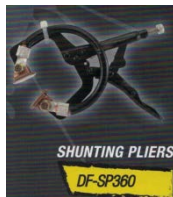
SHUNTING PLIERS DF-SP360

LOCATION: 1000 E I65 SERVICE ROAD N. MOBILE, AL 36617