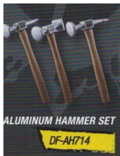
ALUMINUM HAMMER SET DF-AH714

Everything you need for aluminum repair. Lockable system keeps tools organized, clean and safe. This Deluxe version is Ford Approved and includes a bridge puller, 3rd drawer and dust cover.